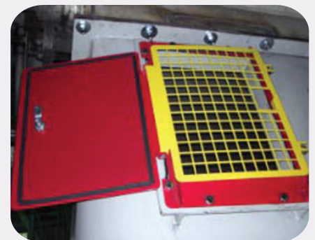
Door opened. Safety screen closed.